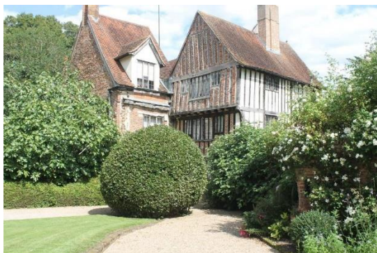
A popular view of the Abbey. (Dorreen Linton)