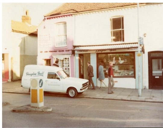
119 High Street